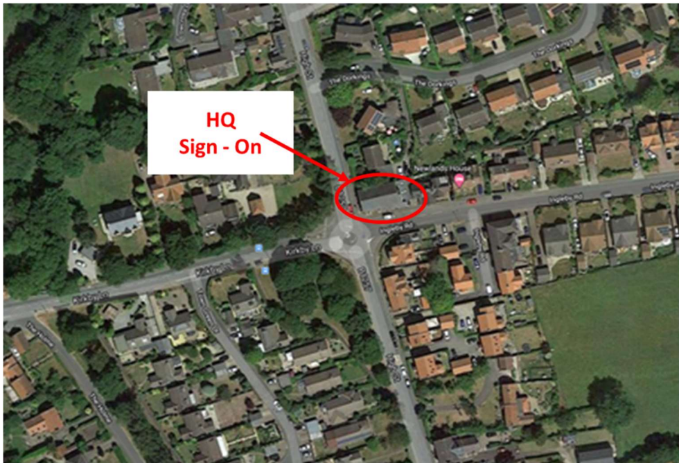
Race HQ – Sign On GPS 54.4493521 N, 1.1581576 W. What3Words (pleasing.oppose.backhand)